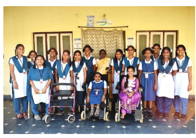
Children at homes