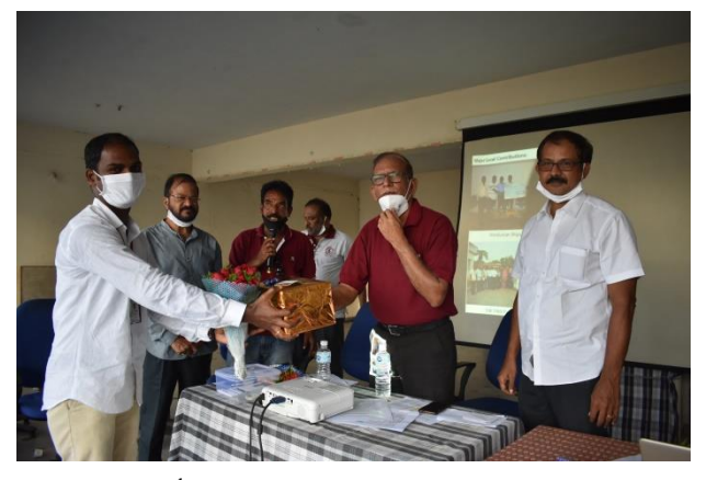
Association Saikorian Members