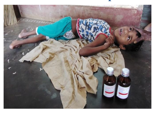
Child from Outreach supported with Epilepsy Medicine