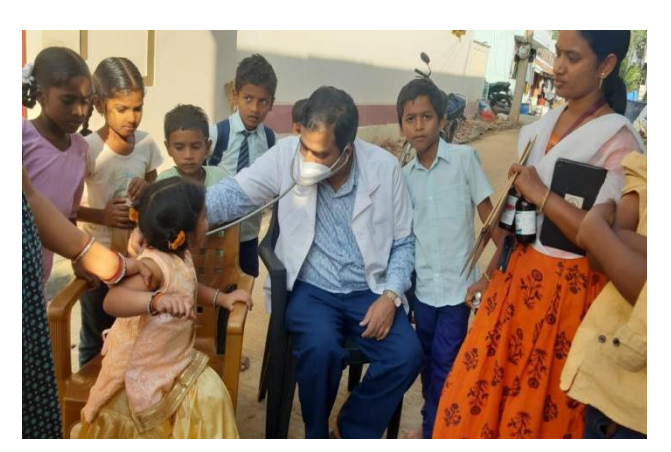
Medical follow-up visit at villages

In 2020, 45 campus children and 83 children from outreach, in total 128 children, attended for physiotherapy at Campus