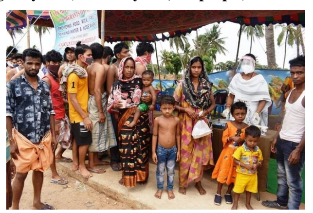
Serving cooked food, snacks and medication at Migrant relief campaign

• Distributed essential groceries, Vegetables, safety gear and Medicines to all Campus challenge and Outreach children during lock down period. (4 times X 150 children)