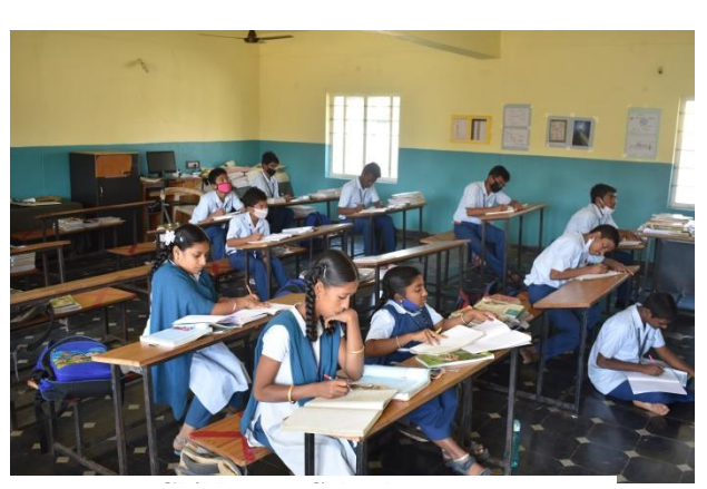
Children writing examinations