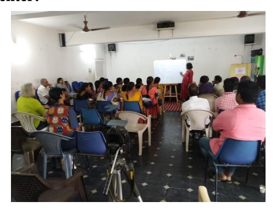
Campus Challenge organized a two days' work shop with Nayi Disha resource center and Nitya Sadhana foundation with intellectual challenged children's parents.