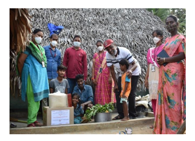
Grocery kits prepared with support from donors

• Distributed essential groceries, Vegetables, safety gear and Medicines to all Campus challenge and Outreach children during lock down period. (4 times X 150 children)