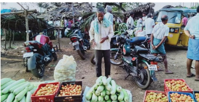
Youngsters and staff involvement at horticulture program