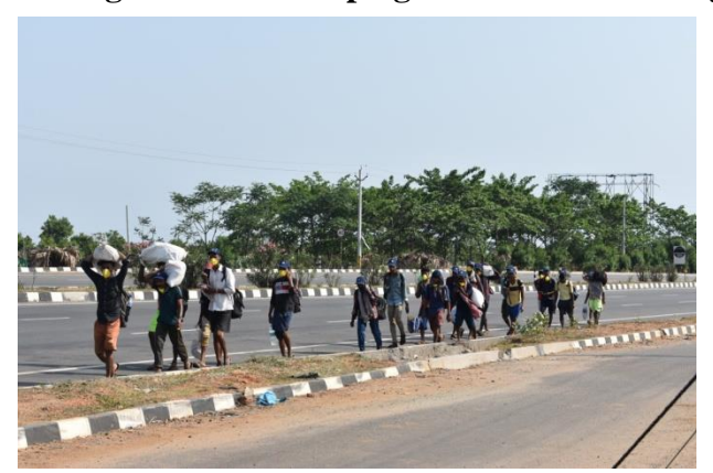
Migrants passing over NH 16

• Migrant relief campaign at the National Highway -16 (for 24 days-25,000 people)