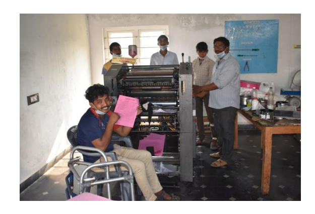
Print shop with young children

There are many young children who have stopped their education in the middle due to their own limitations. Especially in rural area, there are no facilities to continue their Education. For instance, there are colleges for higher Education in this area but there are no ramps for wheel chairs, class rooms are on the upstairs. Even there are no colleges nearby for Hearing impaired children and visually challenged children.