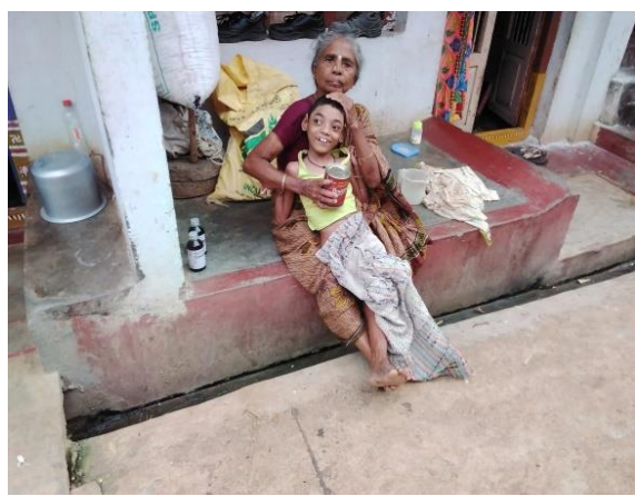
Child from Outreach supplied with Nutrition supplements