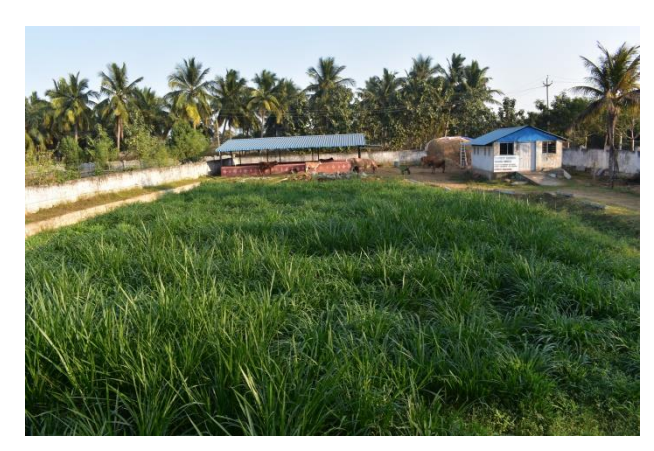
Grass field for cattle grazing