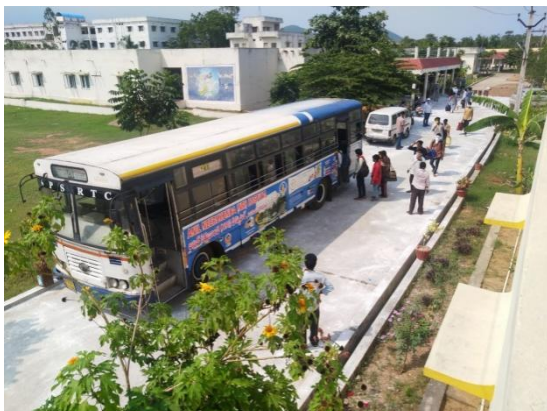
Migrants labour with their children at Campus challenge